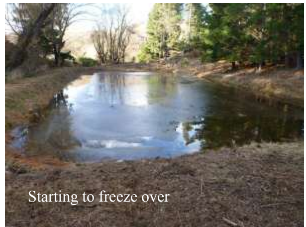
Starting to freeze over